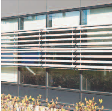
Brunel University, West London

Flexible – Louvres can be spaced to allow more or less natural light into the space and hinged for easy access and maintenance.