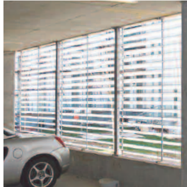
New River Village, Hornsey